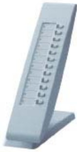
KX-NT303 Optional Module 12 Additional Programmable Key Module