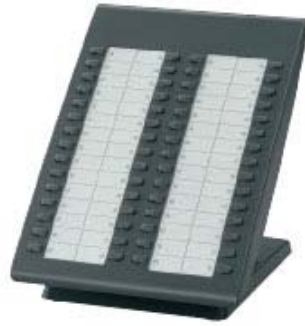
KX-NT305 Optional Module 60 Additional Programmable Key Module (KX-NT346 & NT343 only)