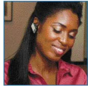
KX-NT307 Bluetooth Module Is available for wireless headset communication.