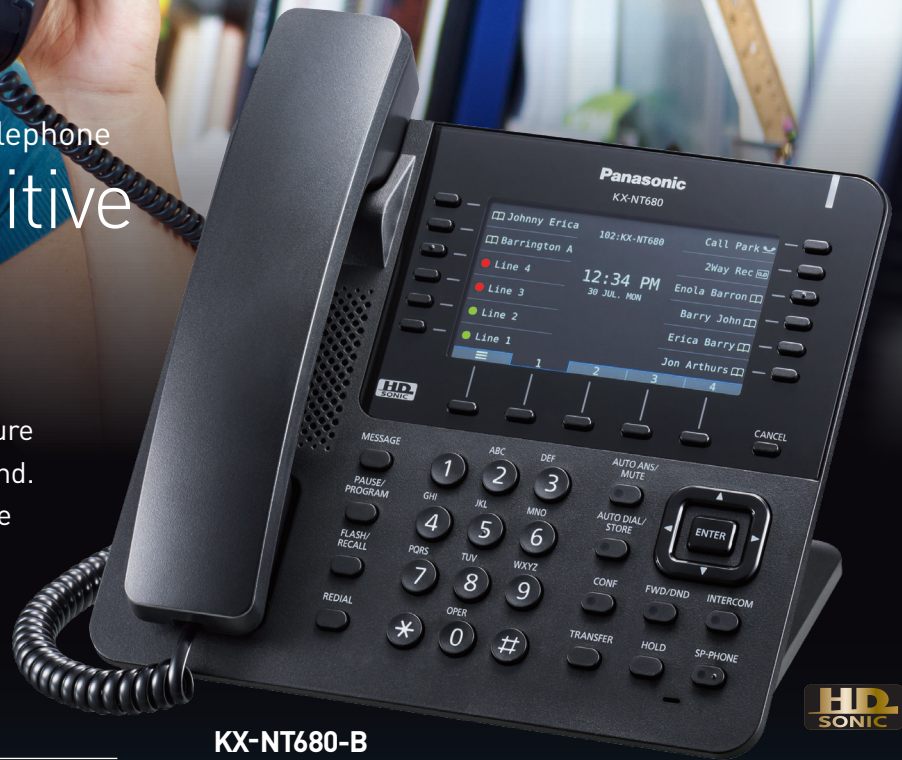
KX-NT680-B Color LCD

Introducing the next generation of communication equipment, ready for the future with the ever-changing business world in mind. This new line of IP proprietary phones feature a clear color LCD, integrated High Definition Audio and an enhanced user interface.