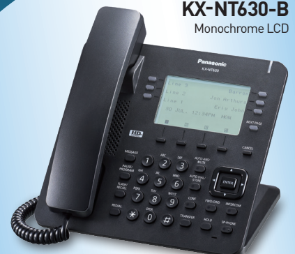
KX-NT630-B Monochrome LCD

The KX-NT680 can import an image file to display on the LCD screen for implementing corporate branding or other information customizing the LCD screen.